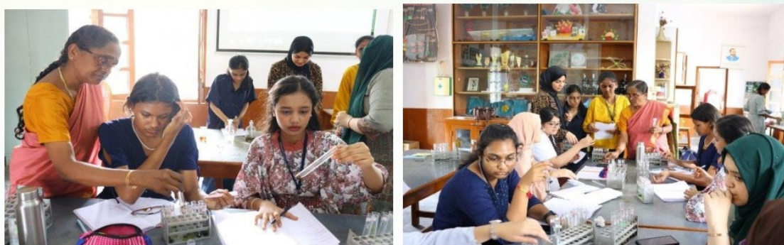
Student Exchange Program

Student Exchange Program was organized by Department of Biotechnology for I & II year B.Sc Biotechnology students of St. Ann's College for women, Mehdiapatnam on 23-24 August 2024 from 9.30am to 3.30pm in Botany Lab. This program included plant solvent extractions and screening of secondary metabolites from Arcahane racemosa , Oryza sativa and Plumeria rubra species. A virtual lab was conducted on Gene Editing technique and its applications in Medicine and Agriculture.