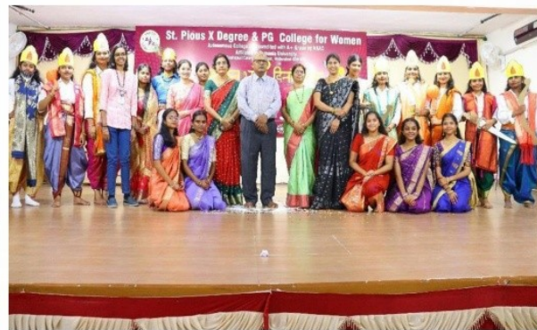
Skit on Mahabharata