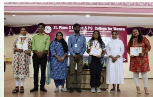
Mahindra Classroom Training and TASK 2024