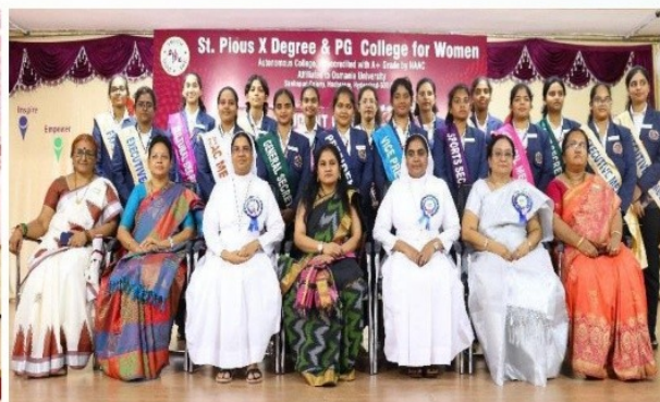
OATH TAKING BY THE COUNCIL