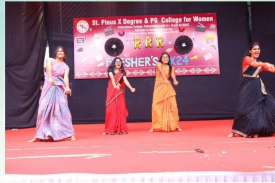
FRESHERS DAY 2024