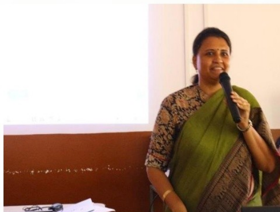
WORKSHOP ON PRESENTATION TOOLS