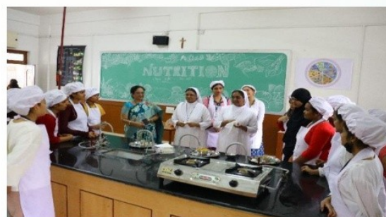
NUTRITION LAB INAUGURAL