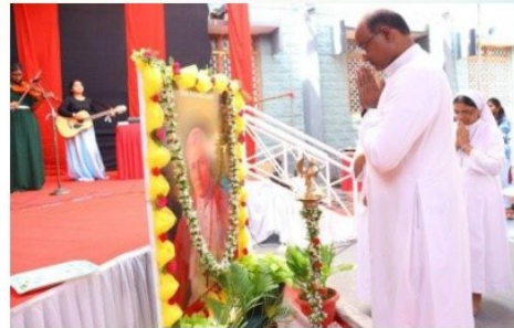
FLORAL TRIBUTES TO ST.PIOUS X