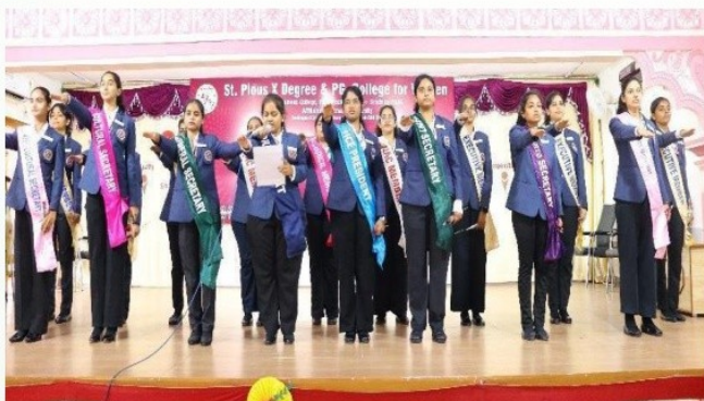
19 TH INVESTITURE CEREMONY