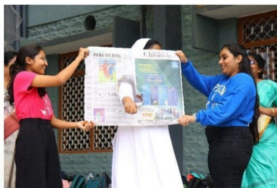
Skill Enhancement Course : Self-Defence