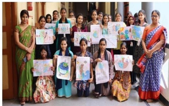
Poster Presentation : World Conservation Day

The Department of Zoology and Genetics celebrated World Nature Conservation day and conducted two competitions in online and offline mode. The objective of our program was to encourage students to highlight the current environmental issues and challenges facing the planet and raise awareness for the same. The online E-poster making competition was held on 28 July 2024. The Theme for the online competition was “Our Land, Our Future” We are the Generations #Restorations. Total 14 students participated in this activity. The offline activity was conducted on 31 July 2024 in Zoology Lab from 11 am to 12.15 pm. The Theme for the offline activity was “Effect of Air Pollution on Mother Nature” wherein students had to make colourful Posters based on the Theme. Total 23 students participated in this activity. The first three winners for both online and offline competitions were awarded with medals for their amazing efforts. Ms. Archana Juyal from dept. of Chemistry was the judge for both the competitions.