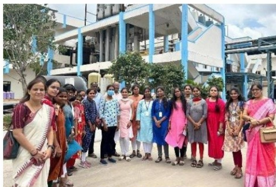
Field trip to MAC Lab