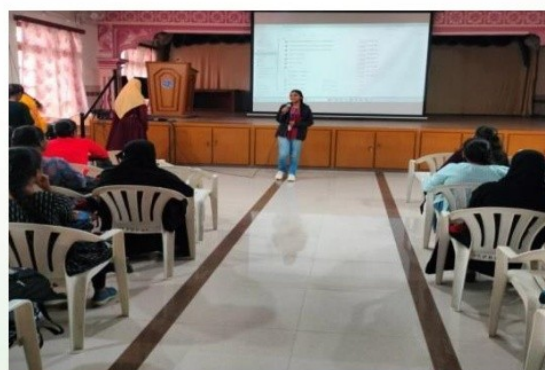
Students ' Presentation