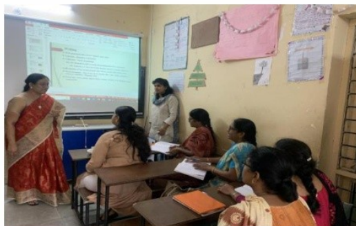
Communication Skills : Emmanuel High School