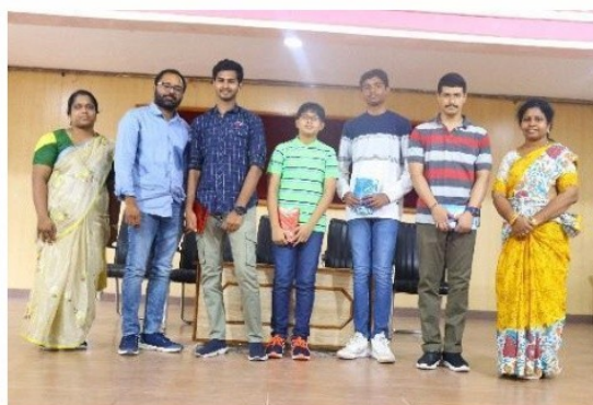
Felicitation of Stepz N Fretz