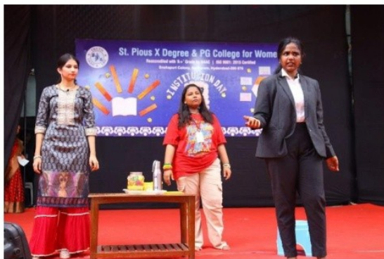
SKIT ON ST.PIOUS X VALUES