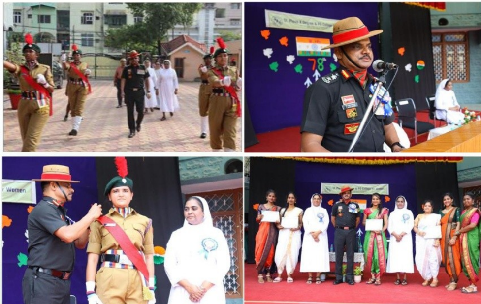
Independence Day Celebrations and Ranking Ceremony of NCC Cadets