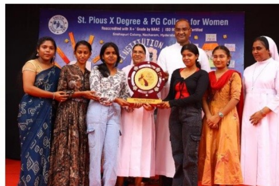
WINNERS OF ROLLING SHIELD