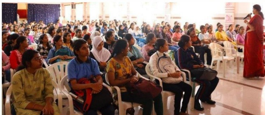
Awareness on NPTEL Courses